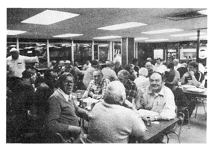
Assembly area on the last work day before Christmas ...

Just a few of our many holiday get-togethers are pictured below: